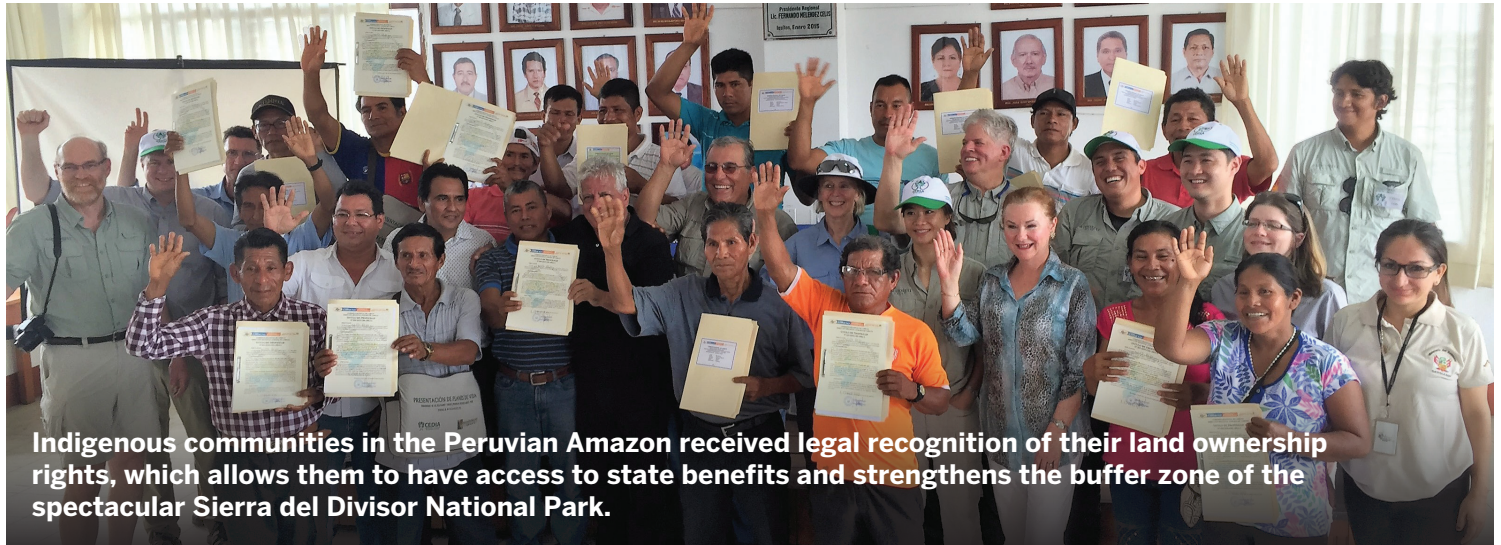
Indigenous communities in the Peruvian Amazon received legal recognition of their land ownership rights, which allows them to have access to state benefits and strengthens the buffer zone of the spectacular Sierra del Divisor National Park.

Representatives of Peruvian indigenous communities receive land titles.