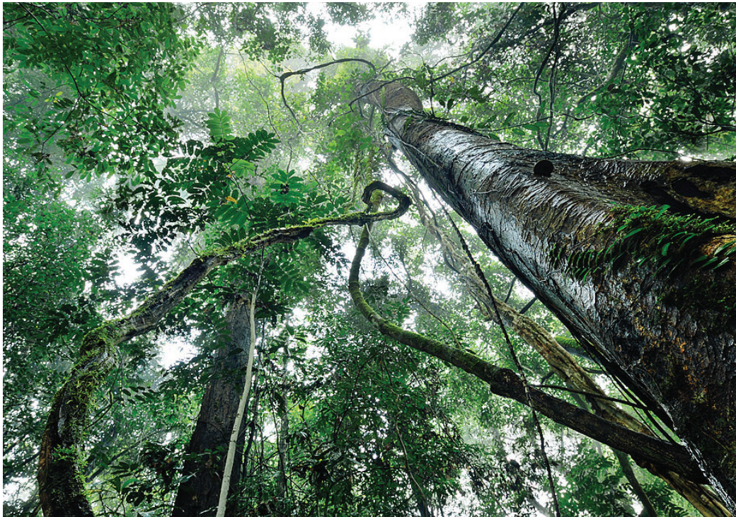
Protecting forests such as this one in Borneo safeguard carbon storage.