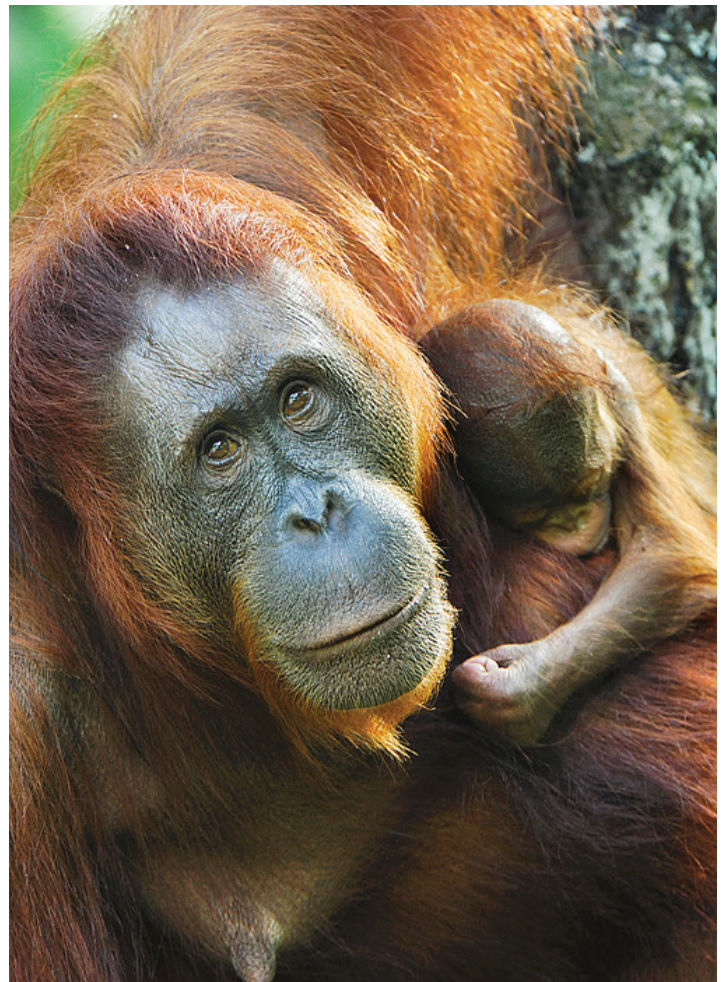
Since 1950, the Bornean Orangutan population has dropped by over 50 percent.