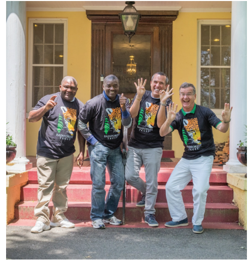
Some of the partner representatives pose in front of Rainforest Trust's office.

"We witnessed every partner having the same total commitment and passion to saving species, assisting communities and protecting our planet as the Rainforest Trust team."