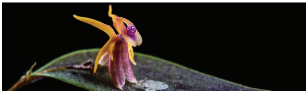
The Selva de Ventanas Natural Reserve contains numerous species of orchids such as this Lepanthes culex .

This 120-acre expansion has greatly contributed to the creation of a protected biological corridor, with the goal of safeguarding 2,471 acres by 2020. Salvamontes Corporation will reintroduce plant species such as the Critically Endangered Ventanas Magnolia and Endangered Yarumal Magnolia to the expanded site, and the creation of a commercial nursery of native and ornamental species will help financially support the management of the reserve. In addition, the conservation group will engage in community outreach and environmental education programs to promote the creation of nature reserves and consolidation of biological corridors in the Alto de Ventanas region.