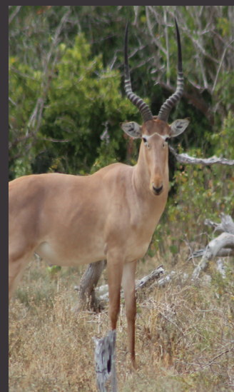
A Hirola, the world's most endangered antelope.

Obtaining the registration certificate for the new conservancy means community members are now empowered and officially have the legal backing to operate conservation efforts in Kenya. In partnership with HCP and the local county governments, the communities will hold the land in trust for the conservation of wildlife in the area. The communities will act as guarantors for Bura East Conservancy and a future adjacent conservancy, which will both be incorporated into local area development plans. Together, these conservancies will protect 1.2 million acres, the largest conservation area in northeastern Kenya. This new conservancy will not only safeguard the Hirolas that currently call this region home, but will also help the species recover by re-establishing a free-ranging population between protected areas.