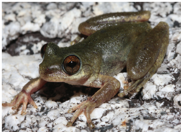
The Endangered Common Mist Frog is found in the Misty Mountains Wildlife Corridor.

In December, South Endeavour Trust and the Queensland Minister for Environment and Heritage Protection will sign an agreement to officially designate the purchased property as the Misty Mountain Nature Refuge. Plans are also underway to strengthen the wildlife corridor through reforestation of degraded lands immediately adjacent to the corridor.