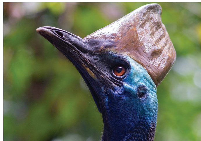
Southern Cassowaries , some of Australia's most iconic species, benefit from the protect area.

"This small land purchase is now connecting a vast contiguous mosaic of montane to lowland rainforest to the Great Barrier Reef, helping create one of the most important tropical land and seascapes on our planet."