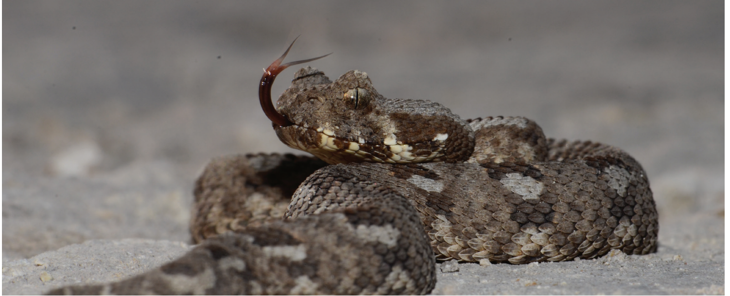
The Albany Adder had not been recorded in almost a decade before a team from the Endangered Wildlife Trust, Rainforest Trust’s partner, rediscovered it.

The rediscovery of the threatened Albany Adder – a tiny viper soon to be declared “extinct in the wild” since it had not been seen in almost a decade – is sparking a major conservation initiative to safeguard this rare reptile’s habitat in South Africa.