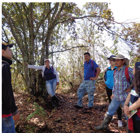
Community outreach and environmental education initiatives will accompany the new reserve.

Rainforest Trust and local partner Salvamontes Corporation worked to expand Selva de Ventanas Natural Reserve by 120 acres this June, strategically linking a vital biological corridor in Colombia's Antioquia district. The purchase and protection of this area prevented the conversion of the site's forests to pasture land, which has been incredibly detrimental to the region's biodiversity.