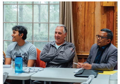
Rainforest Trust staff and partner representatives watch a presentation.