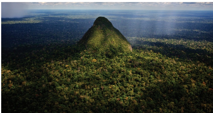
El Cono is an iconic, dormant volcanic cone in Sierra del Divisor.