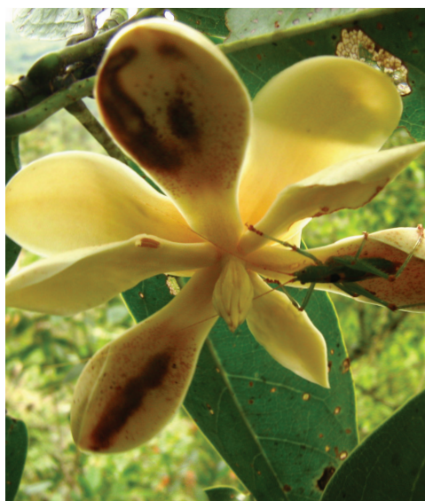
A flower of the Ventanas Magnolia tree , of which only 25 individuals remain in the world.

The expansion of Selva de Ventanas Natural Reserve safeguards vital habitat in the biodiverse Andes for Critically Endangered and Endangered plant species.