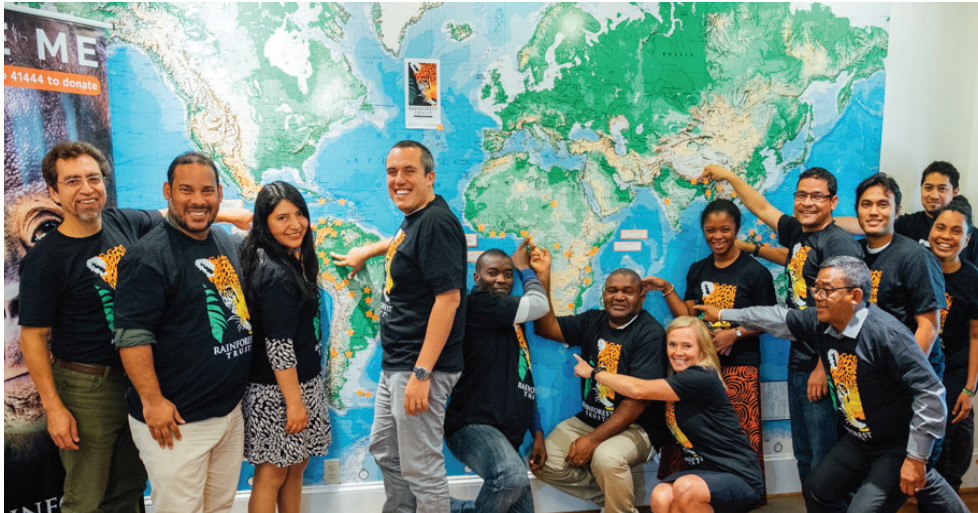
The partner representatives point to their project countries.

"We witnessed every partner having the same total commitment and passion to saving species, assisting communities and protecting our planet as the Rainforest Trust team."